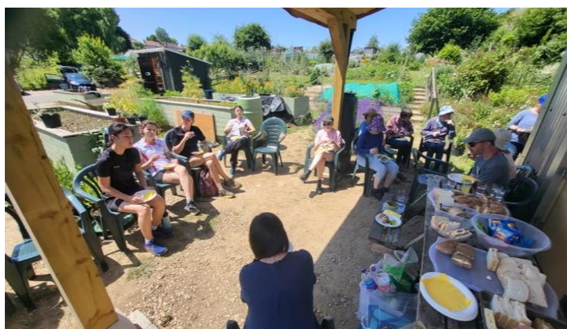
A well-earned lunch break at the allotment